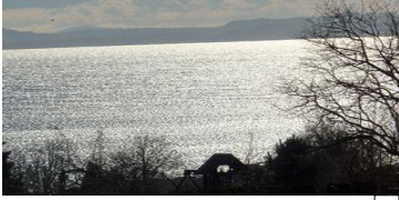
A P A R D